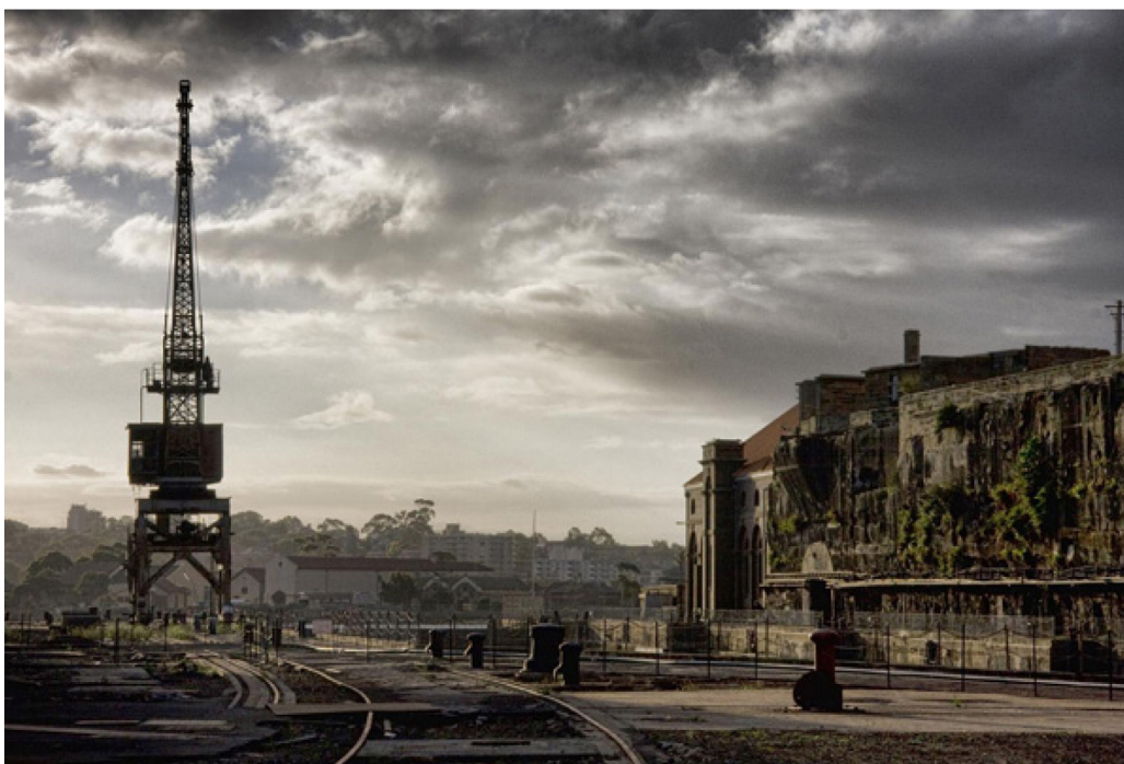
02: Steven Young, View of Cockatoo Island, Sydney Harbour .