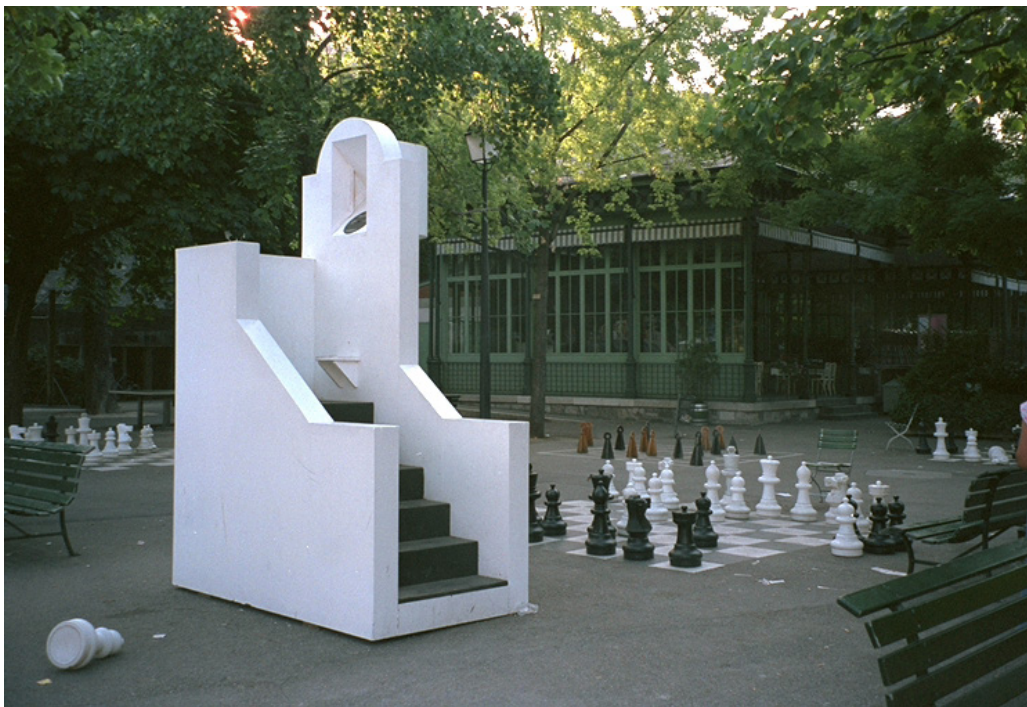
01: Peter Greenaway, The Stairs/Geneva: The Location . Photo: Christophe Gevrey