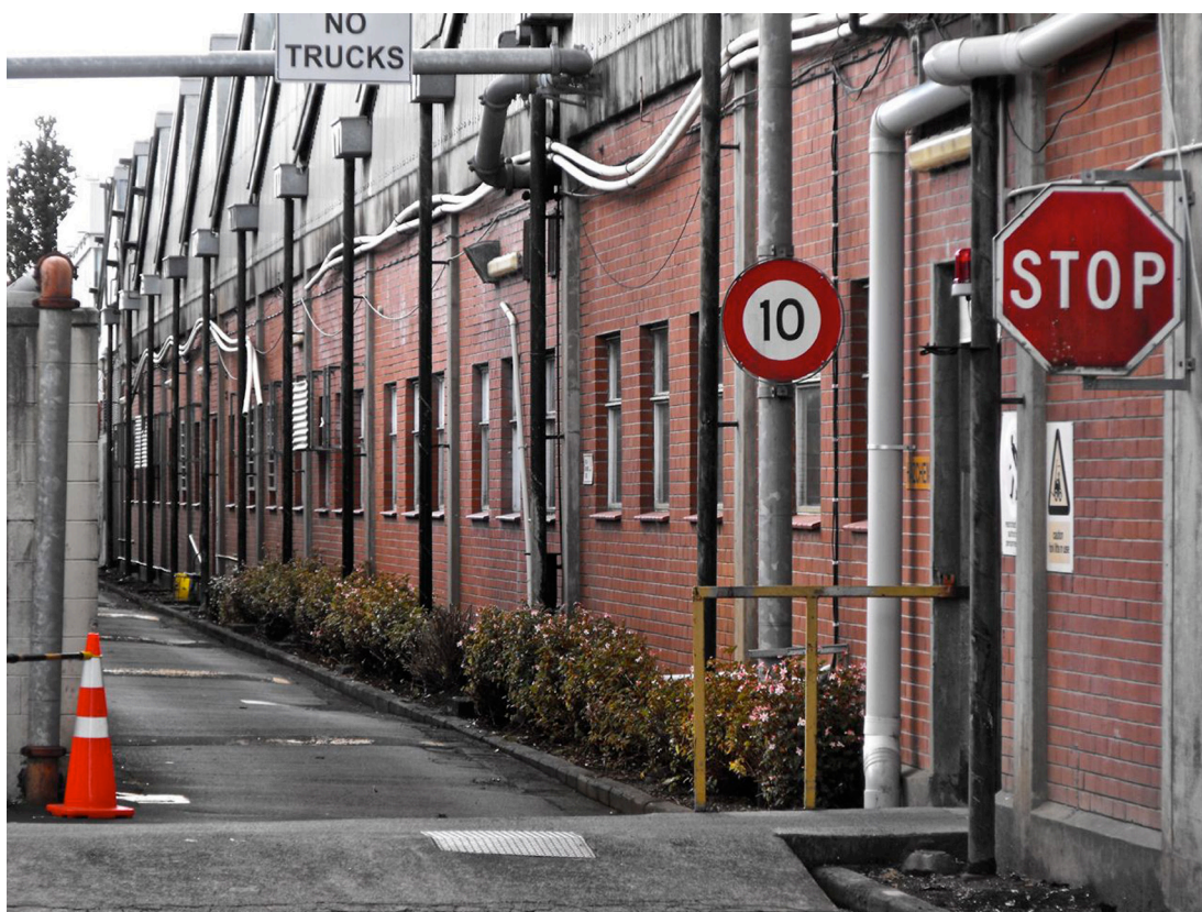
The architectural environment of the path from Rosebank Road to the Whau River.

11:30. Mid morning on the first day of the performance, knee-deep in clay mud, a substance described as "soft tissue... mineralisations...the substratum for the emergence of biological creatures asserting itself..." 01 This soft stuff made my footsteps heavy and clumsy. In much the same manner, my tongue, another soft tissue, found it difficult to pronounce the name of the river correctly, for I had collected at least five different ways of saying 'whau' based on the cultural proclivities of local New Zealanders: 'foe', 'phow', 'fa-oo', 'faux', and according to some locals, 'wow'.