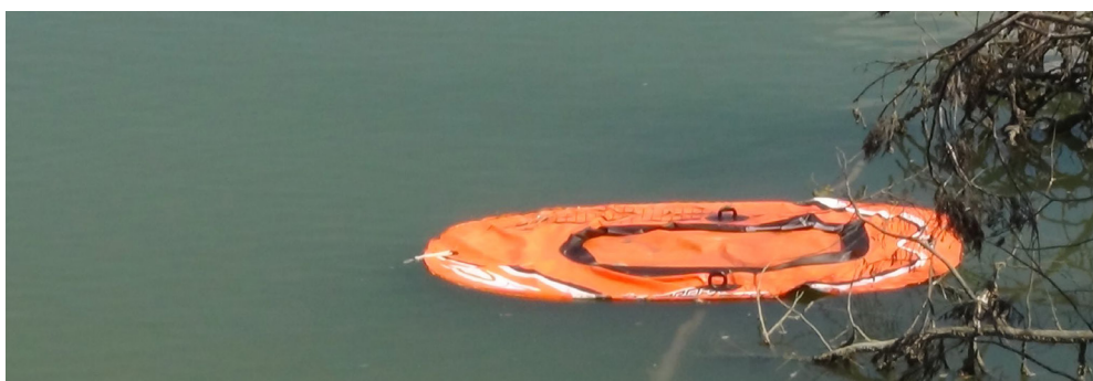
The Whau River, a semi-natural water body.