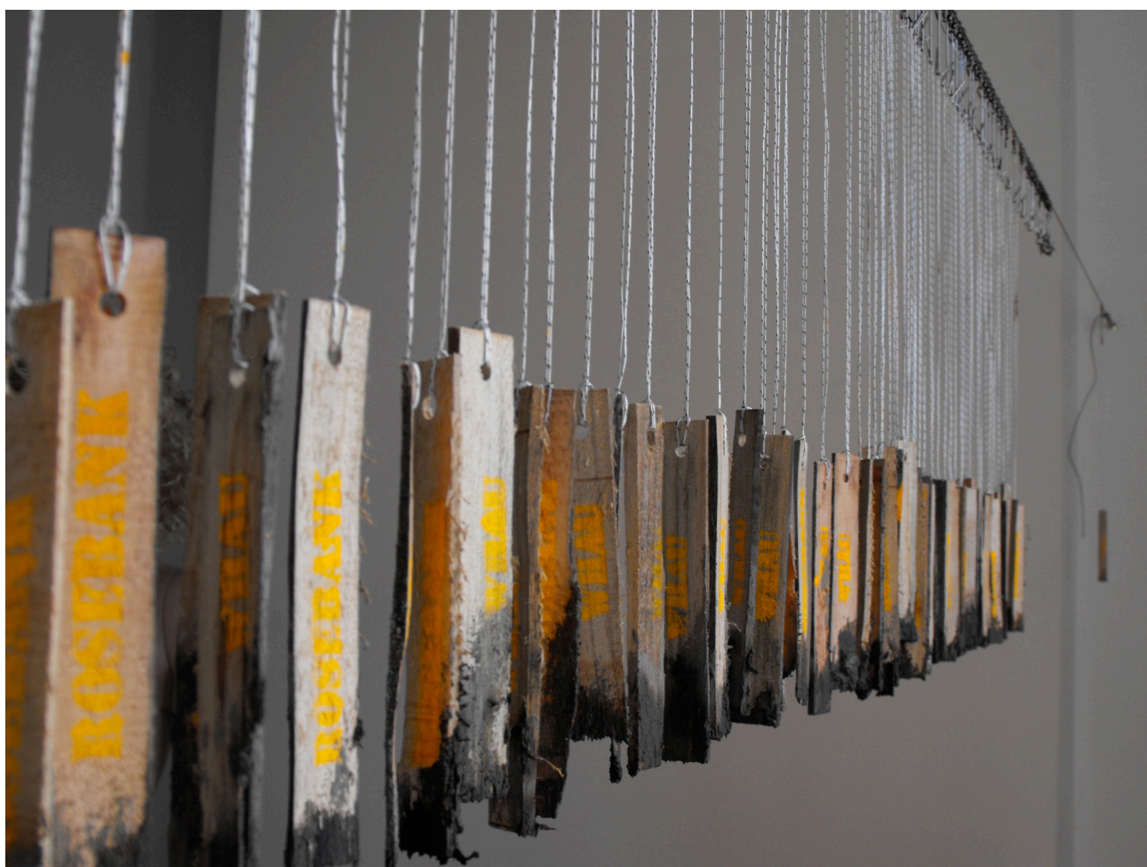
"moving stuff" represented at Artifacts of Place, a group exhibition at Snowwhite Gallery, Auckland, 2012.