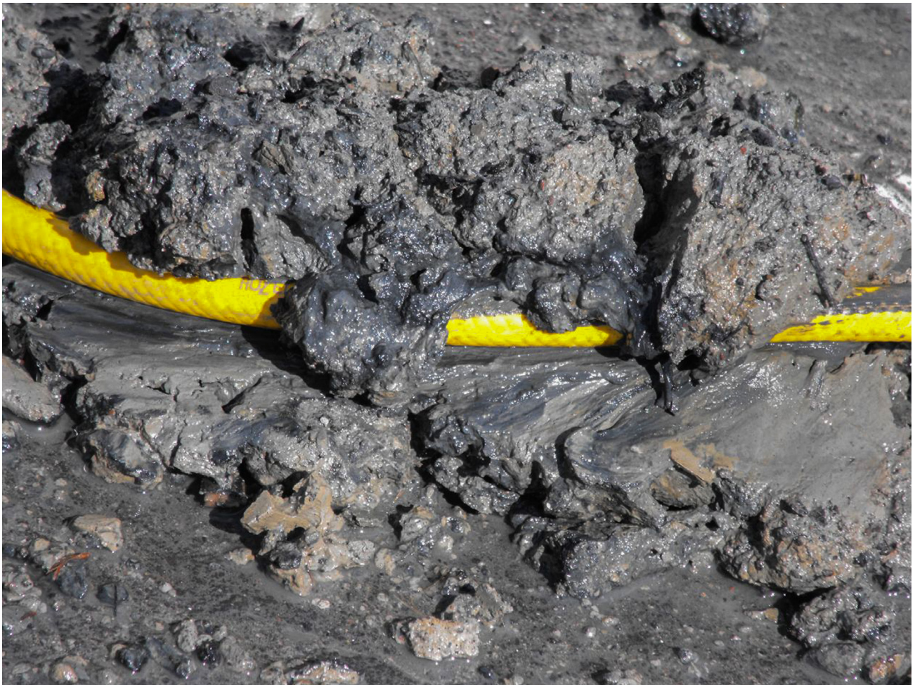
The mud.