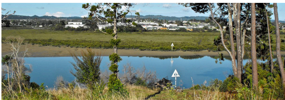
A mangrove horizon.