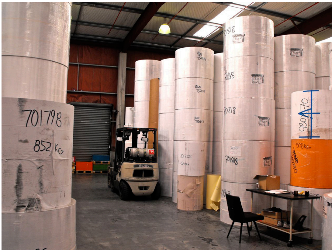
Inside Croxley Stationary, Rosebank Road, Auckland, New Zealand.